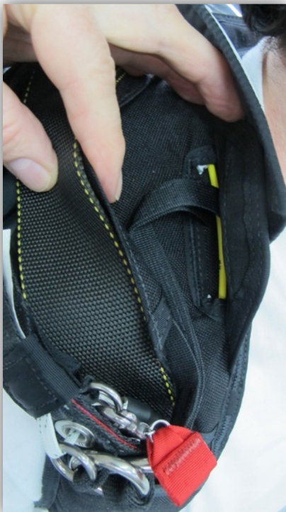
NEW Collins Lanyard Location

Collins Lanyard is now located in front of right side yoke under the RSL channel