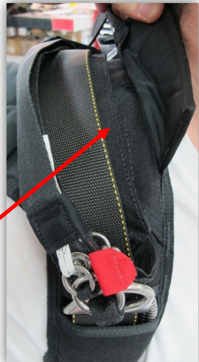
NEW Collins Lanyard Location

Collins Lanyard is now located in front of right side yoke under the RSL channel