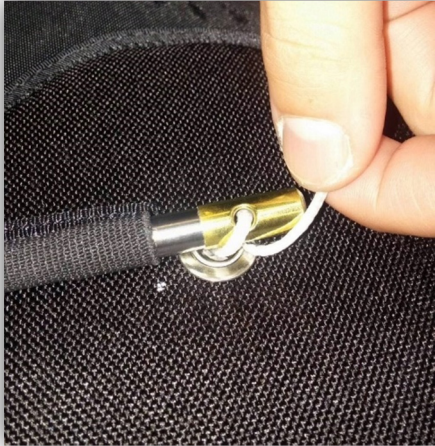
Improper Closing Loop Routing

Instructions: Place the reserve closing loop through AAD cutter according to diagram.