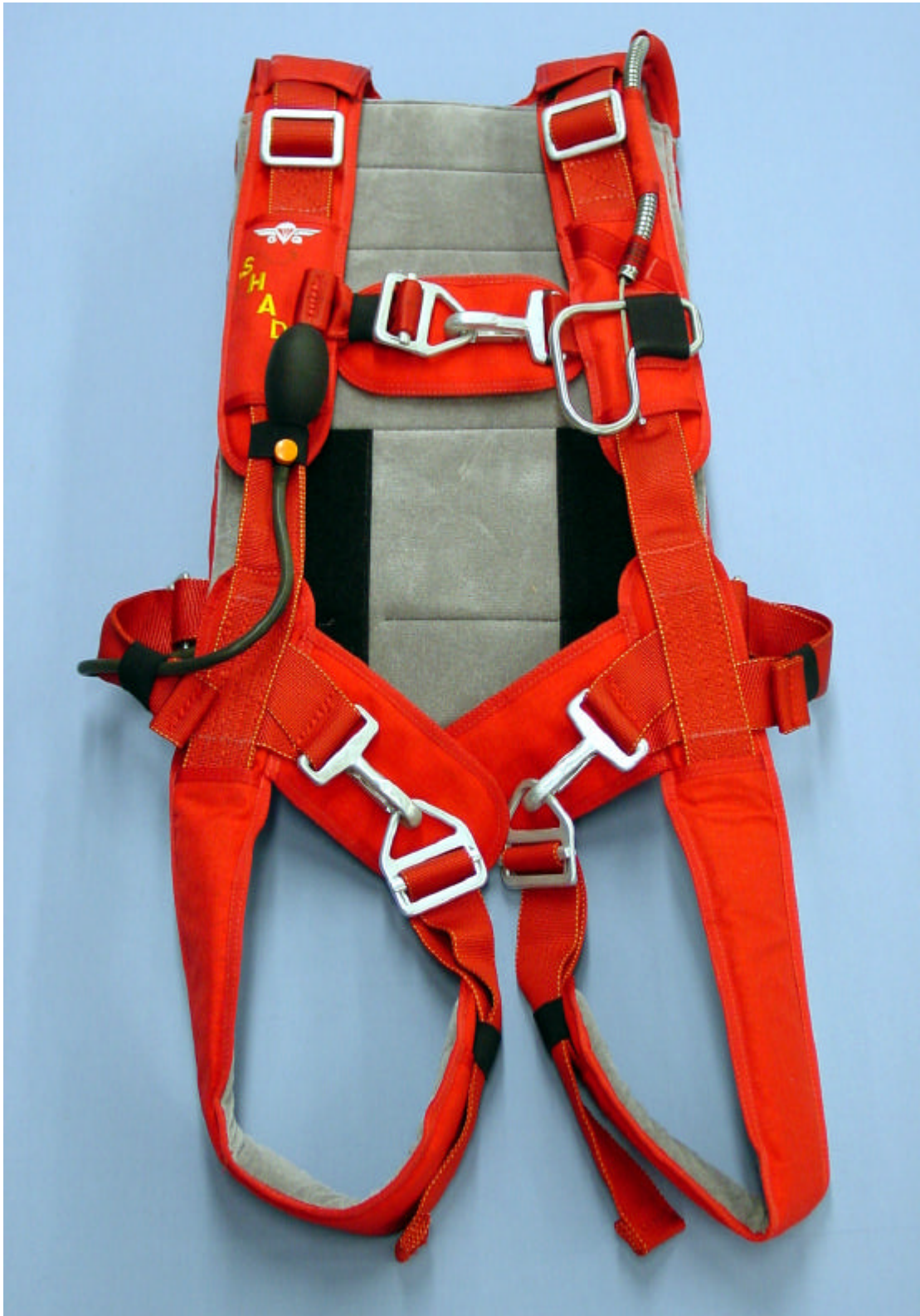
Fig 1 GQ 750 "Shadow" Parachute Assembly