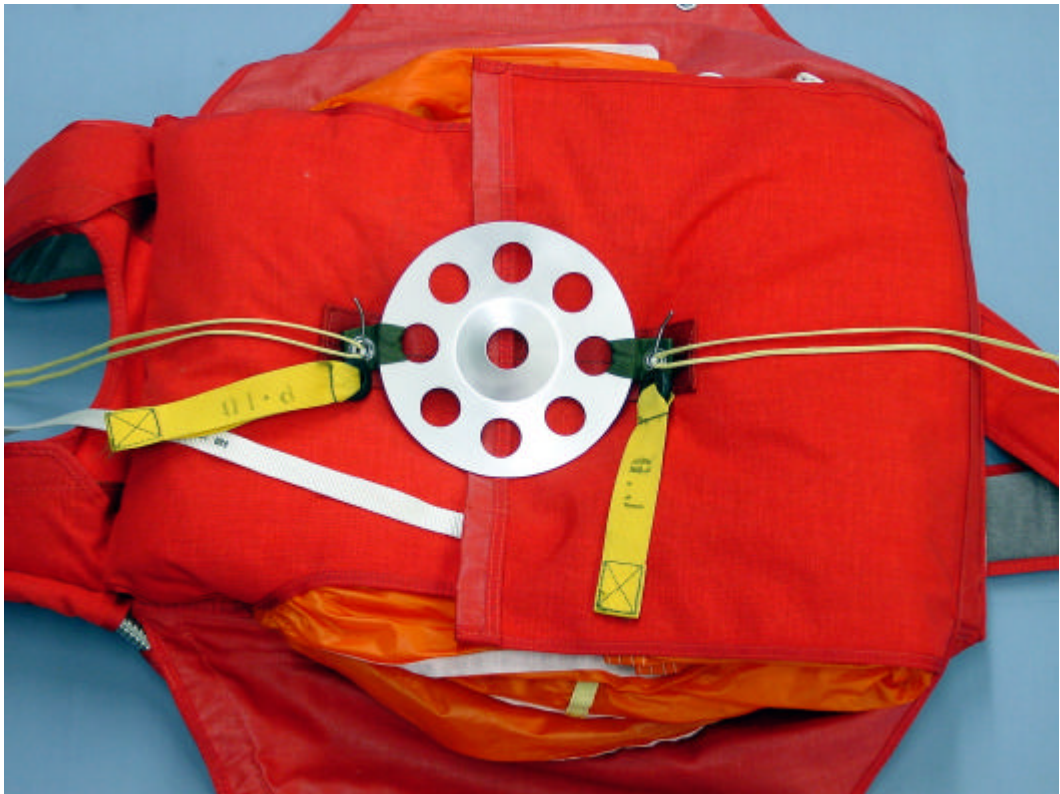
Fig 21 Positioning the kicker plate