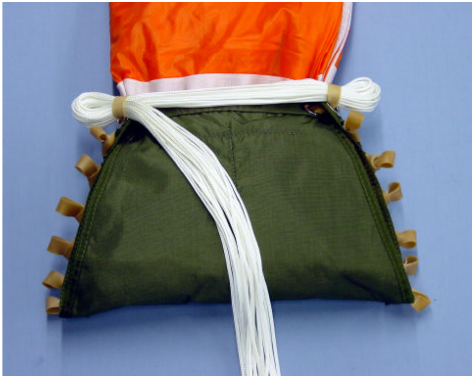
Fig 11 Forming the diaper mouthlock