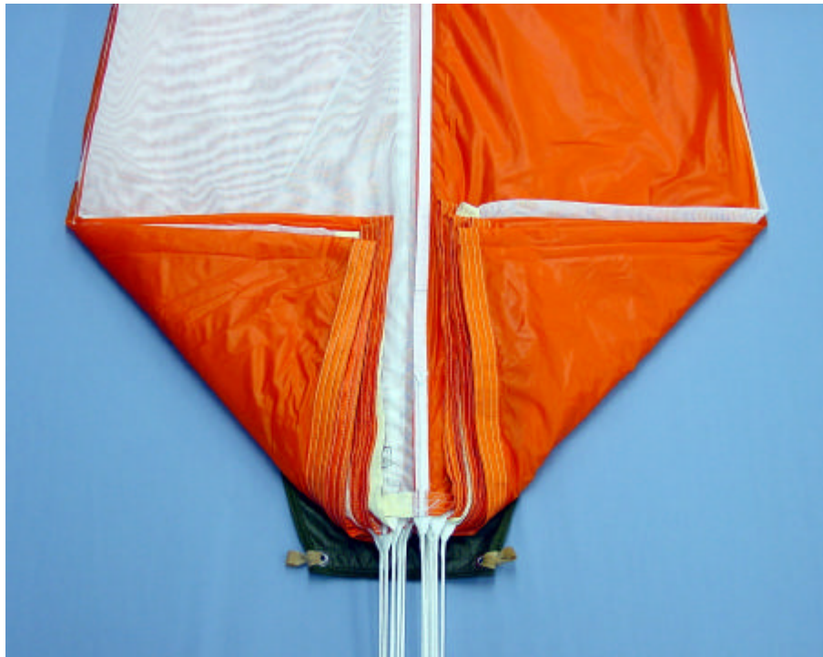
Fig 8 Folding the canopy : stage 2