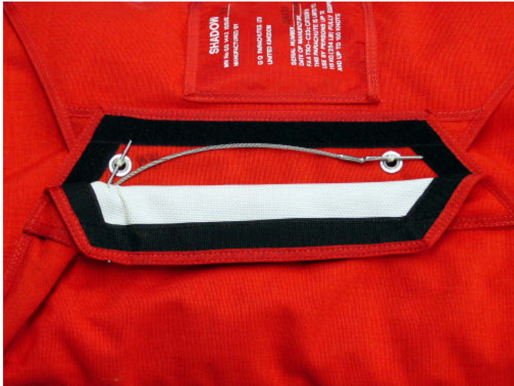
Fig 25 Container closed ripcord pins fitted