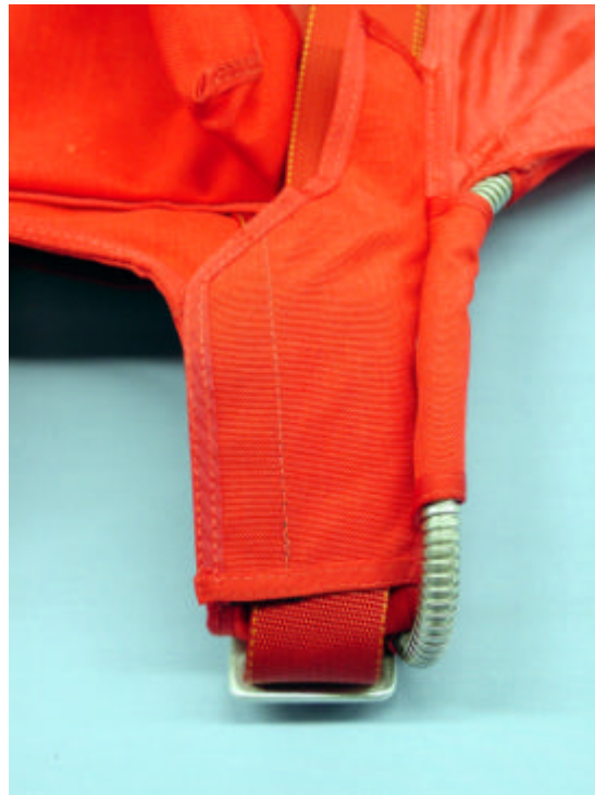
Fig 14 Lift web covers secured