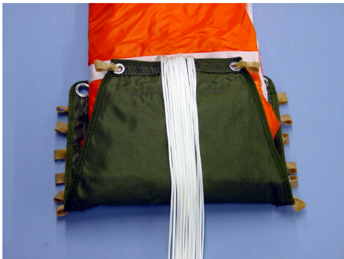
Fig 10 Closing the diaper : stage 1

8.3 Continue stowing the lines into the elastic bands until all bands are filled. Ensure that 305 mm (12 in) of lines remains unstowed. Fig 12 shows all the lines stowed.