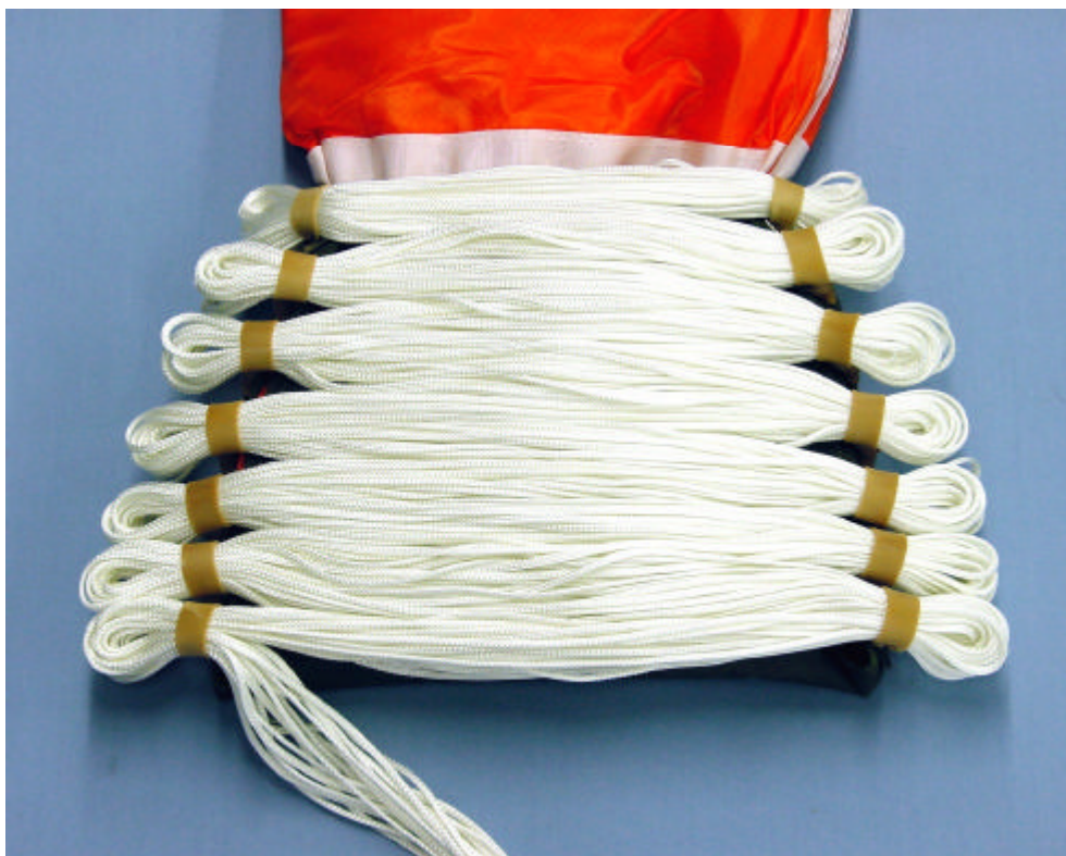
Fig 12 Diaper closed rigging lines stowed