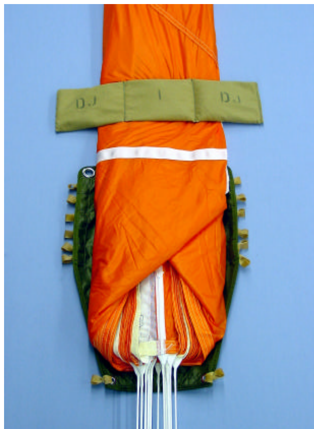
Fig 9 Canopy folded