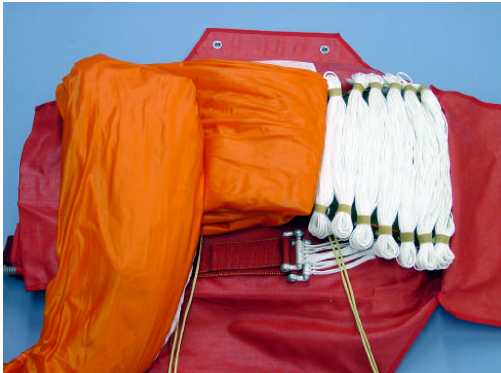
Fig 17 Stowing the canopy : second fold