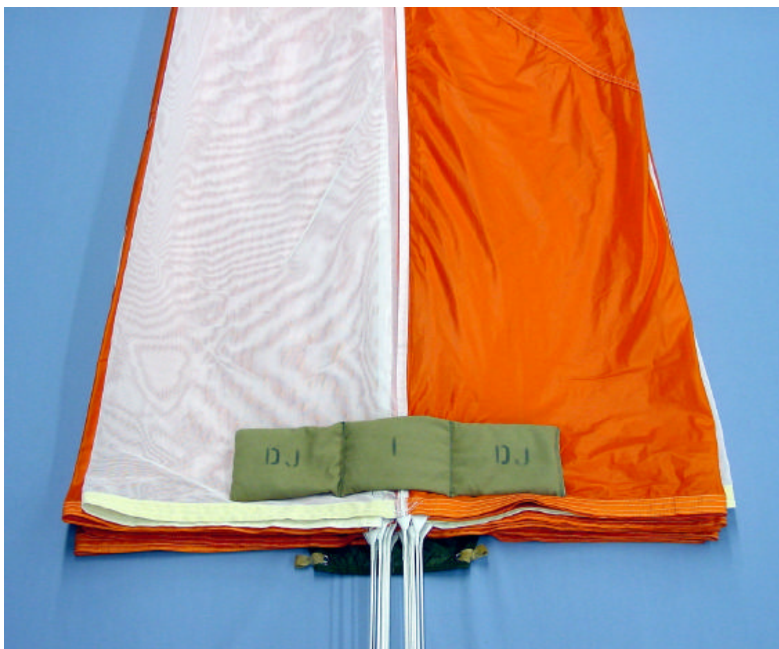
Fig 7 Folding the canopy : stage 1

7.5 Fold the whole length of the right hand half-set inwards to cover the central seam and bring the folded left hand panels across to the right hand outer edge (Fig 9).