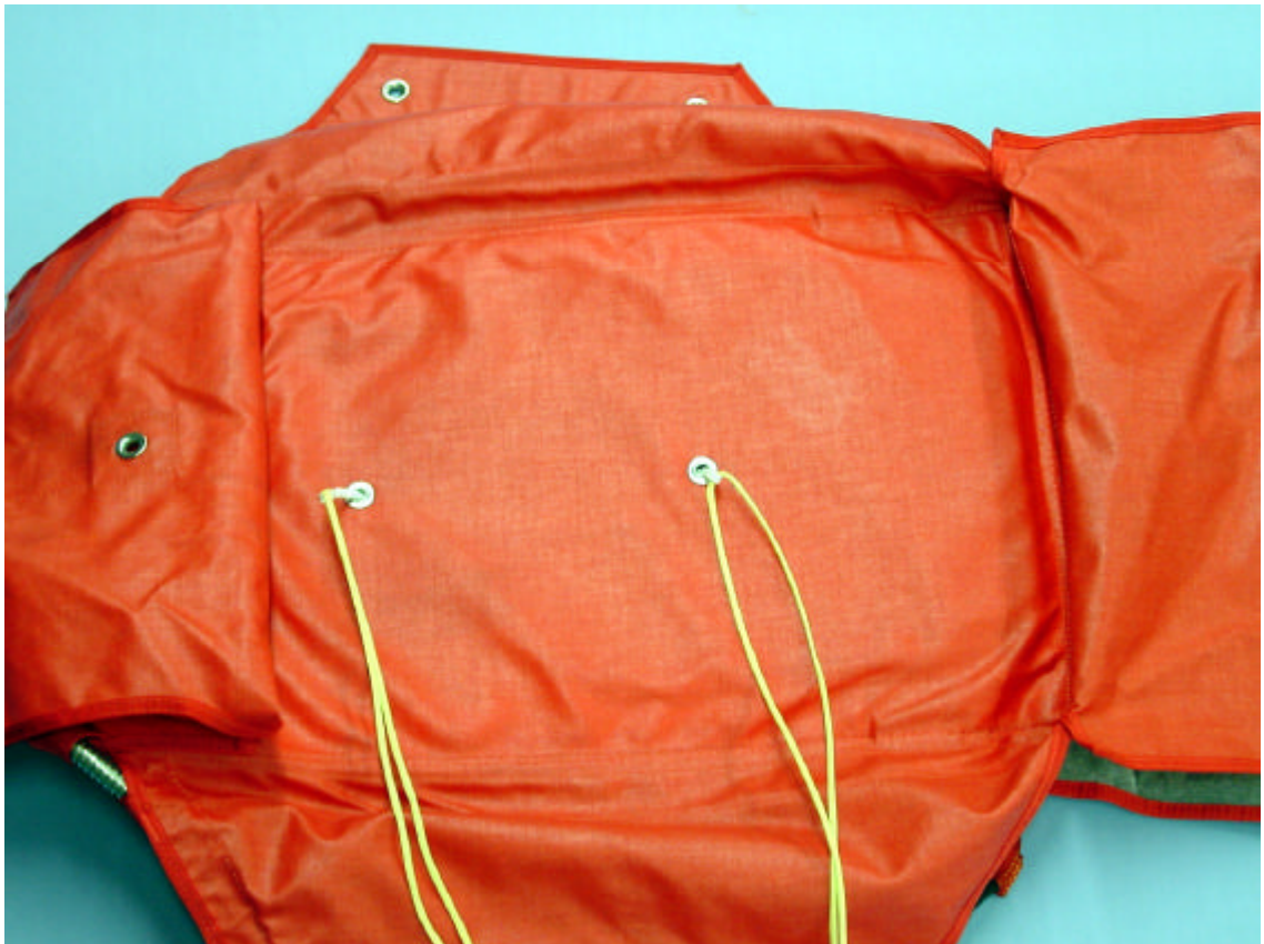
Fig 4 Fitting the closure loop