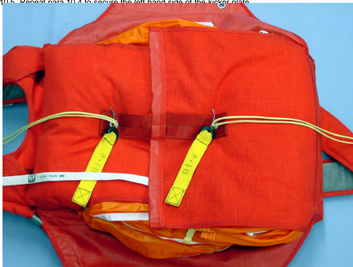
Fig 20 Closing the container : stage 1

10.5 Repeat para 10.4 to secure the left hand side of the kicker plate