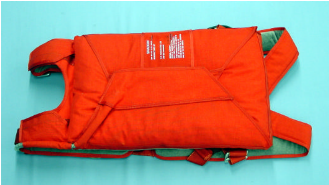
Fig 26 Packing completed