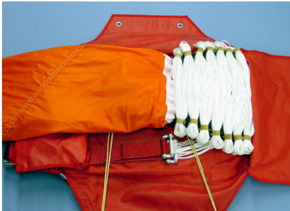
Fig 15 Lift webs and diaper positioned