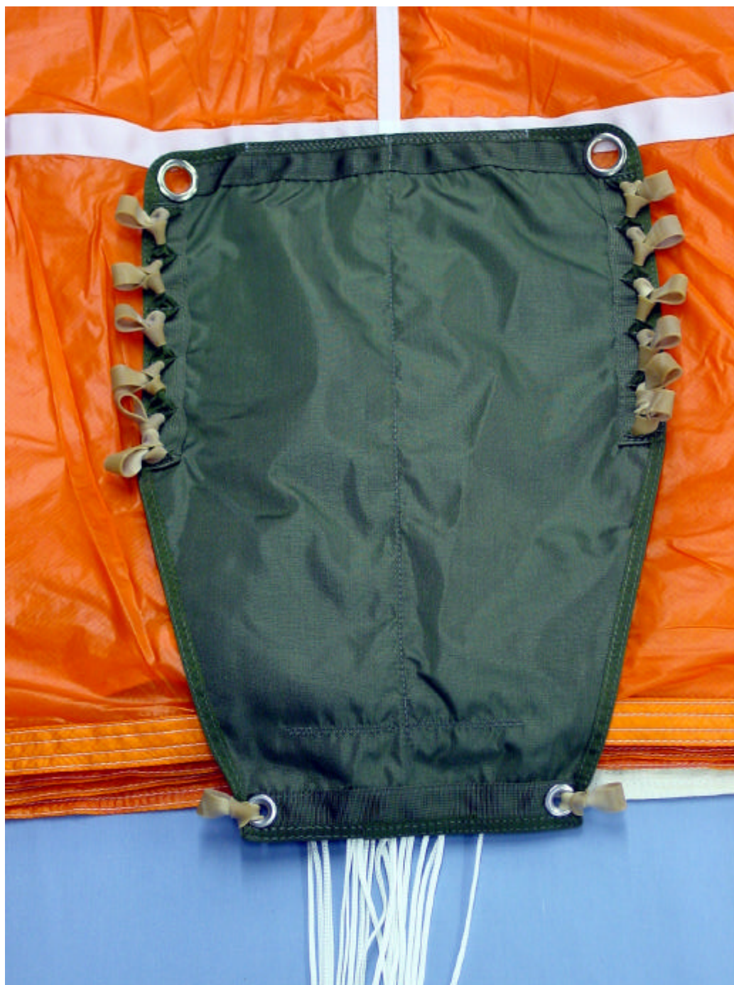
Fig 5 Diaper prepared

5.1 Attach 51 x 13 mm (2 x 0.5 in) elastic bands to each of the webbing tape loops (10 total), attach further bands to the left hand and right lower loops as shown in Fig 5. Attach two further bands to the two eyelets ensuring that they are positioned to the side of the flap as shown in Fig 5 and not to the lower edge of the diaper.