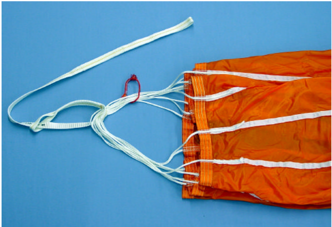
Fig 2 Attaching the connecting line