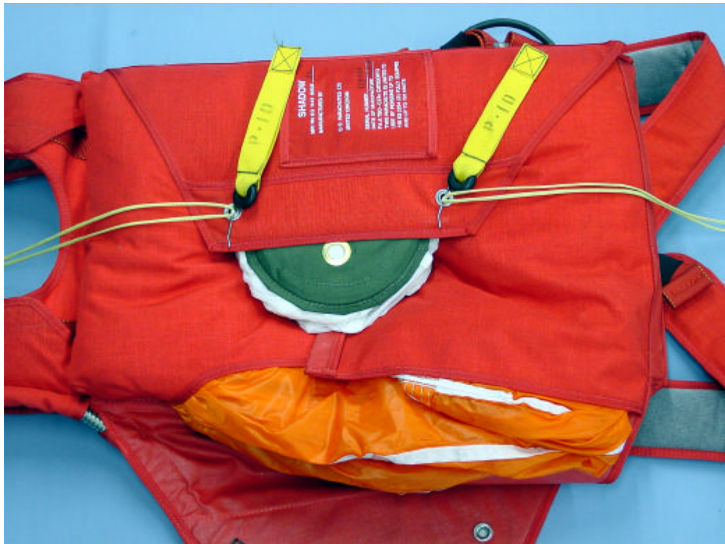
Fig 23 Closing the container : stage 2