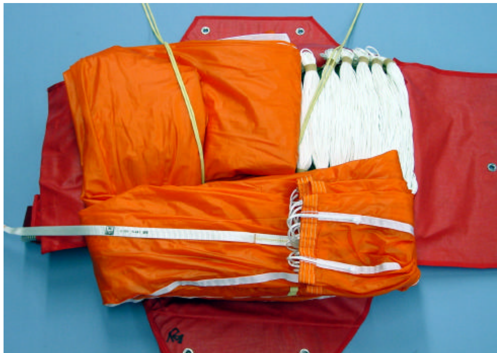
Fig 19 Stowing the canopy : final fold