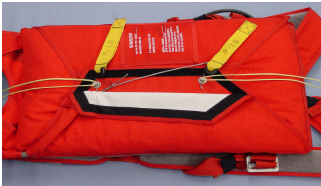
Fig 24 Container closed