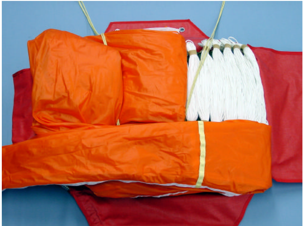
Fig 18 Stowing the canopy : third fold