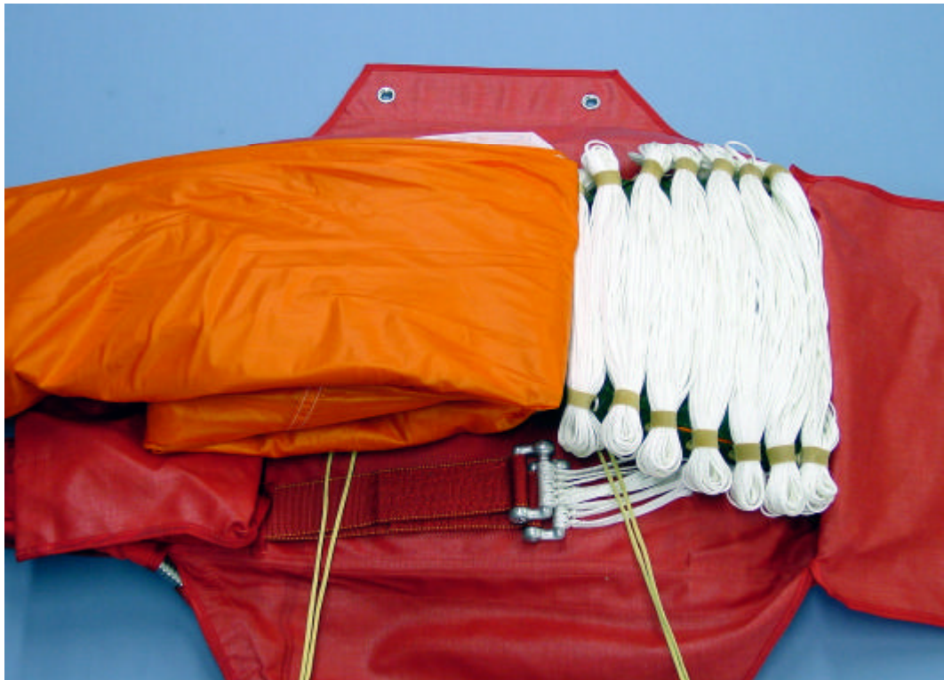
Fig 16 Stowing the canopy : first fold