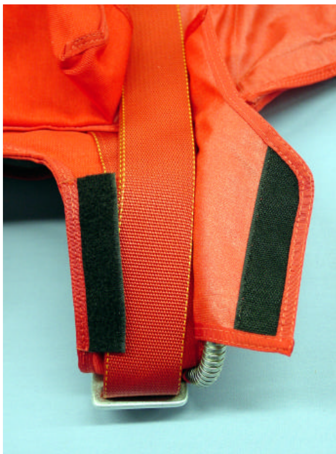
Fig 13 Lift webs positioned in covers

9.5 Form the final fold by folding the canopy apex back so that the apex vent hem lies level with the diaper mouthlock as shown in Fig 19, then open out the apex material to fill the area between the stowed diaper and the pack side wall. Finally fold the vent lines under the folded apex and route the auxiliary parachute bridle line as shown.