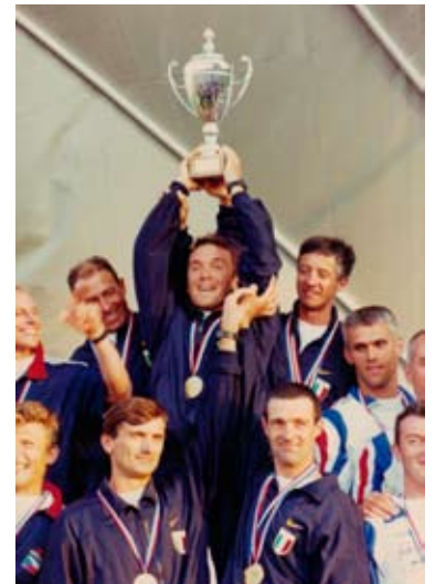
Italy World Team Accuracy Champions